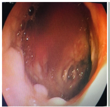
Fig.1: Endoscopy shows the nodular and erythematous appearing gastric mucosa in the gastric wall and antrum.