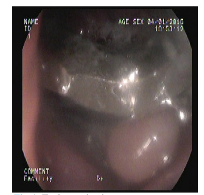
Fig.4: Endoscopic view

Our case was rare and no similar case was reported pre-