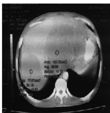
Fig 2: Two hypodense masses in both liver lobes.