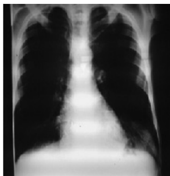
Fig 1: Ill defined consolidation is noted in left lower lobe.