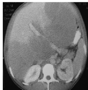
Fig 3: Large hypodense masses in liver causing hepatomegaly & pressure effect on portal veins and stomach