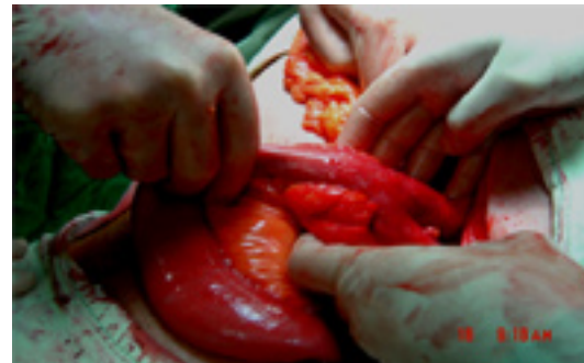
Figure 3: An infiltrative intestinal tumor (7.5 cm in length and 3.5 cm greatest diameter) was seen at the ligament of Treitz with thickening of the mesentery and surrounding fat wrapping.

Surgical resection of the tumor was planned. An upper midline laparotomy was performed and an infiltrative intestinal tumor (7.5 cm in length and 3.5 cm greatest diameter) was seen at the ligament of Treitz with thickening of the mesentery and surrounding fat wrapping. Mesenteric induration and enlarged lymph nodes were present (Figure 3).