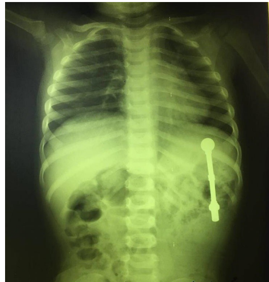
Figure 2. Magnets in the left upper quadrant