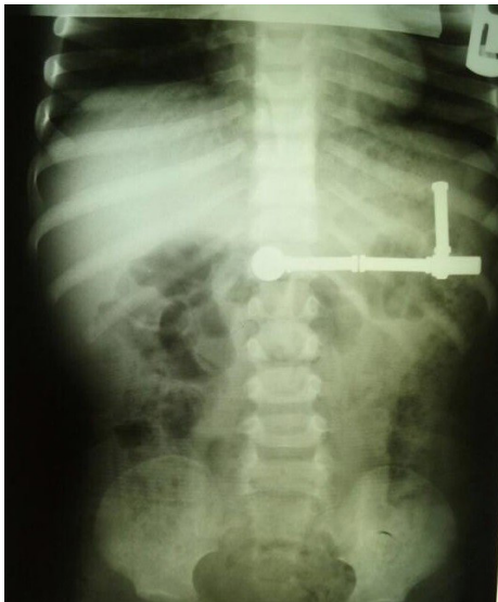
Figure 1. Multiple magnets in interesting alignment