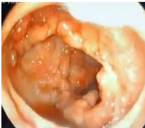
Figure 1. Neuroangliomas in hamartomatous/suspected Cowden's polyposis syndrome