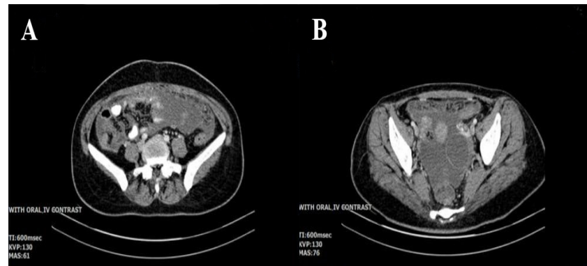
Fig. 2: The abdominopelvic CT shows an echogenic lesion 23×40 mm in the right ovary consistent with a complicated dermoid cyst and a hemorrhagic follicle in the left ovary