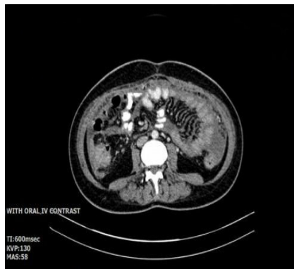
Fig. 1: Abdominopelvic CT reveals diffuse omental haziness