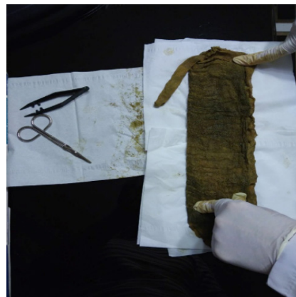
Fig.3: A biopsy forceps and was found to be a 10 × 40 cm retained gauze covered with bilious exudates

comprehensive metabolic panel, and urinalysis were within normal limits. She was seen by her physician on multiple occasions. Her symptoms did not improve over time.