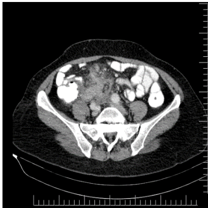
Fig.1: Computed tomography