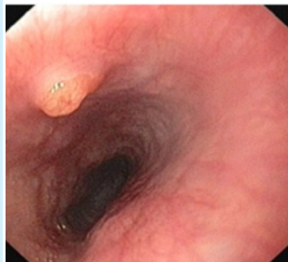
Fig.1: Endoscopic view :small polyplesion (5 mm) was seen in the upper esophagus

A 43-year-old woman referred to our gastroenterology clinic with dyspepsia and heartburn. In her medical history, she complained of epigastric pain and globus signs and took anti-acids periodically. She did not have weight loss and there was no family history of gastrointestinal malignancy. She had microcytic anemia, which was treated with daily ferrous (2 pills, 50 mg elemental iron). During the physical examination, only tenderness at epigastrium was noted. Clinical signs including globus Pharyngeus did not improve in spite of two months of treatment with proton pump inhibitors (PPI). Considering the patient's age, upper gastrointestinal endoscopy was done and a small polyp lesion (5 mm) was seen in the upper esophagus (figure 1). A biopsy sample was taken and H&E staining is shown in figures 2, 3, and 4.