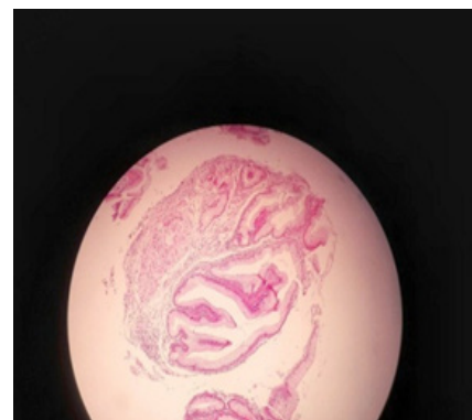
Fig.4: H&E slides