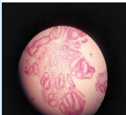
Fig.3: H&E slides