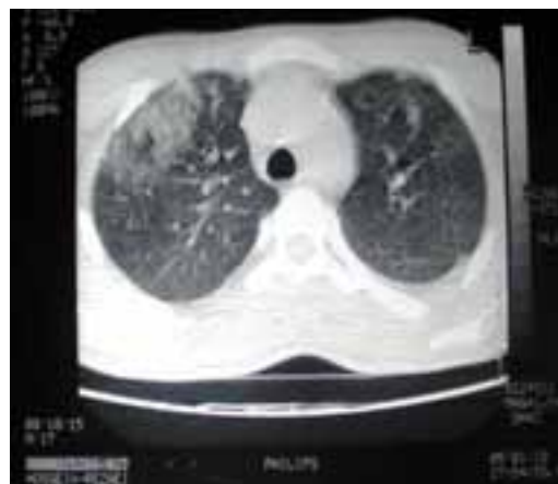
Fig.2: Chest radiograph and high resolution computed tomogram of lung showing pulmonary infiltrations.