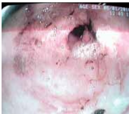
Fig.3: Upper gastrointestinal endoscopy showing antral and prepyloric lesions five days after treatment

showed significant improvement (figure 3). Treatment was continued by prescribing cyclophosphamide monthly pulse. Gastric lesion was completely healed and GI bleeding did not recur after 6 months follow-up. All pulmonary, renal, articular, and skin lesions were recovered.