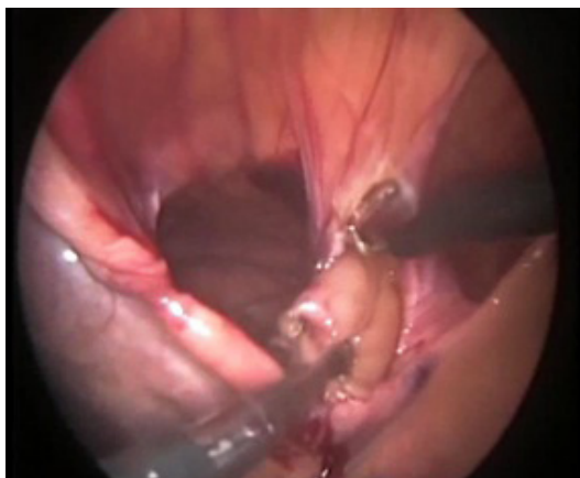
Fig. 1: Excision of hernia sac